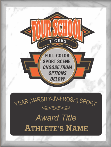
#TMP68 (6"x8") (Shown on White Marble) $19.00