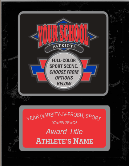
#TMP79 (7"x9") (Shown on Black Marble) $21.00