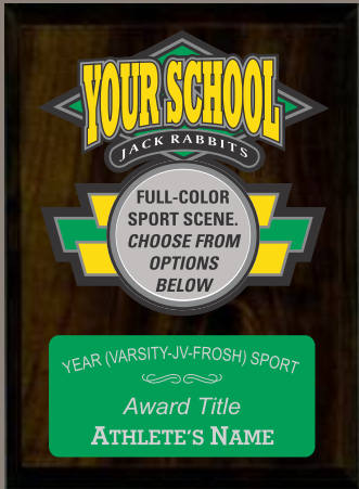
#TMP57 (5"x7") (Shown on Cherrywood) $17.00