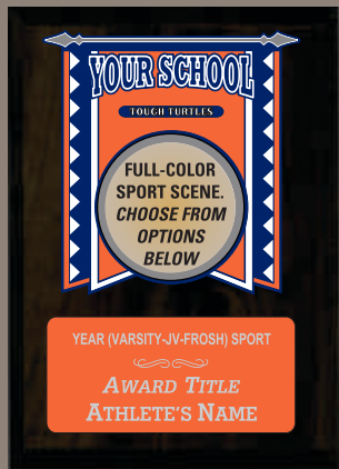
#TMP57 (5"x7") (Shown on Cherrywood)

Our signature school team award plaques.