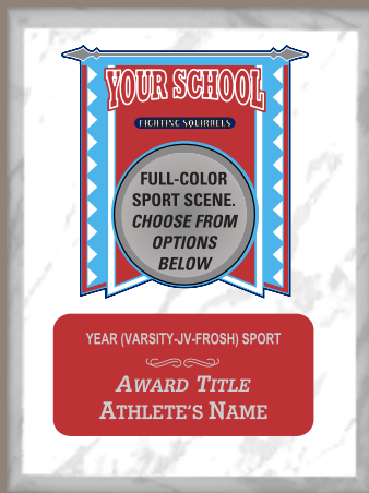
#TMP68 (6"x8") (Shown on White Marble)