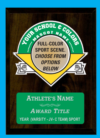
#TMP57 (5"x7") (Shown on Cherrywood) $16.25

Our signature school team recognition plaques.