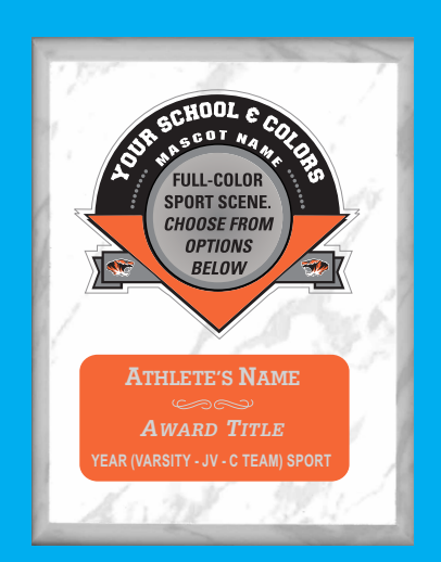
#TMP68 (6"x8") (Shown on White Marble) $18.25