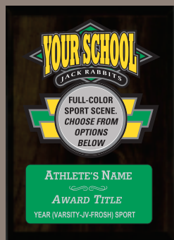
#TMP57 (5"x7") (Shown on Cherrywood)

Our signature school team award plaques.