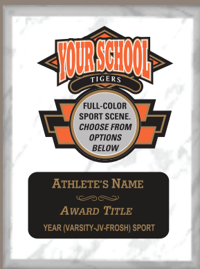
#TMP68 (6"x8") (Shown on White Marble)