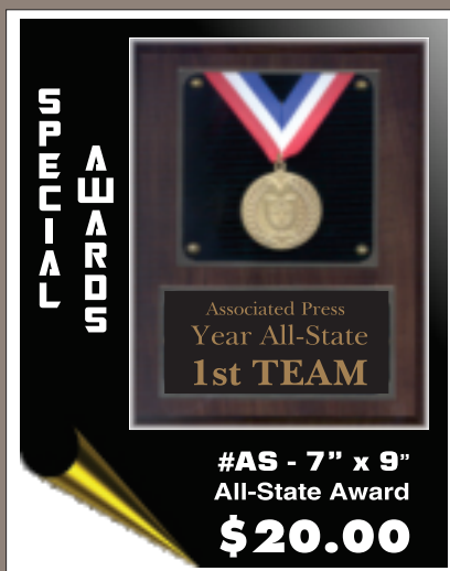
#AS - 7" x 9" All-State Award $20.00