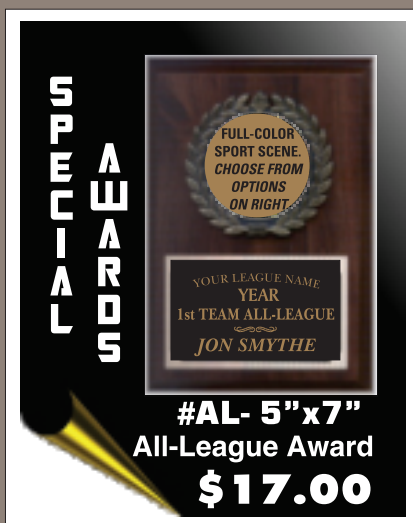
#AL- 5"x7" All-League Award $17.00