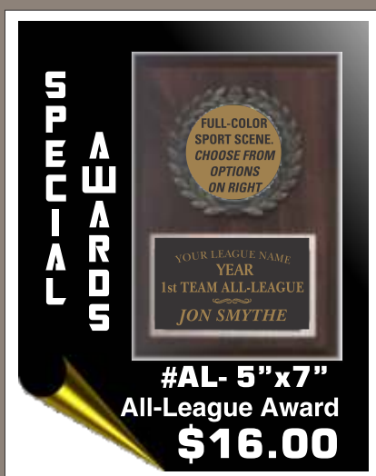
#AL- 5" x 7" All-League Award $16.00