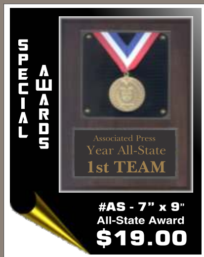
#AS - 7" x 9" All-State Award $19.00