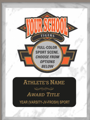
#TMP68 (6"x8") (Shown on White Marble) $15.50