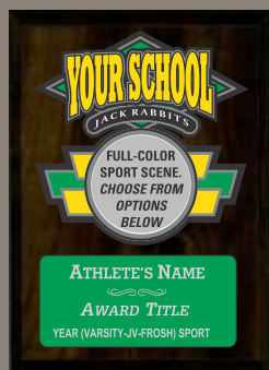
#TMP57 (5"x7") (Shown on Cherrywood) $13.50

Our signature school team award plaques.